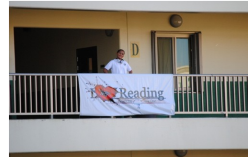
JFK Student poses behind one of the RAT2012 Banners displayed at the JFK Courtyard.