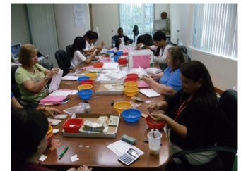
READ-A-THON 2012 Counting at Bank of Guam in Hagatna