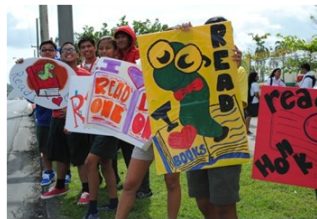
READ-A-THON 2012 KICK OFF WAVE in front of JFKHS on February 10, 2012 .