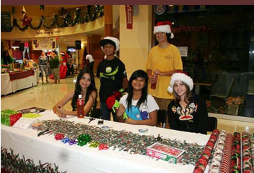
The Gift Wrapping Table Members.