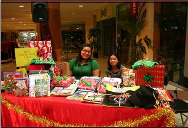
Door Prize Table