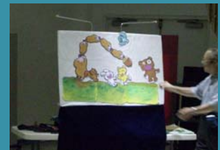
All the animals helped the squirrel until the nut came up with a family of moles.