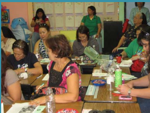
Members get busy creating from recycled items.